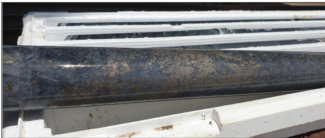
Photograph 2 – Intersection of NPDD013 at 578.4m showing matrix to semi-massive sulphides (Po- Pn-Cpy)