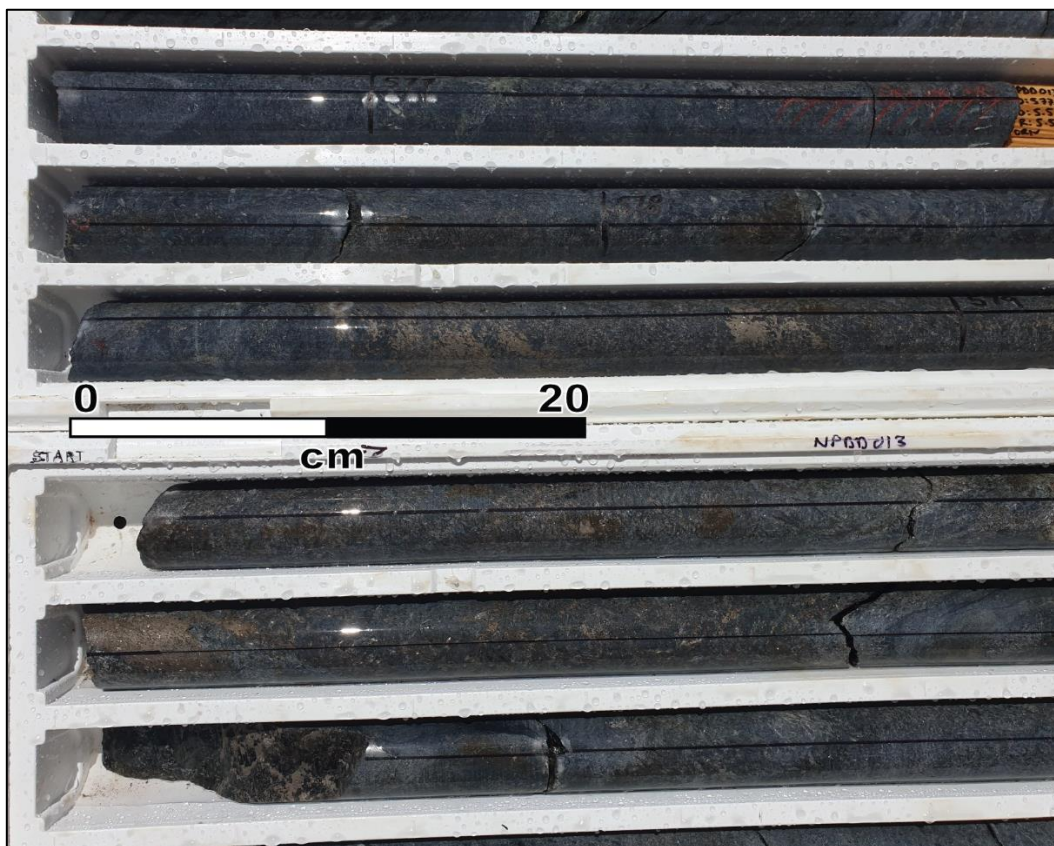
Photograph 1 – Intersection of NPDD013 from 576.8m to 581.5m showing matrix and heavy disseminated sulphides (Po-Pn-Cpy)

Regional exploration at Nepean currently comprises the ground dipole-dipole induced polarisation (IP) survey that recently commenced over the Nepean North Prospect of the Nepean Nickel Project (Figure 2), where a recent geochemistry review highlighted the prospectivity of the ultramafic sequences for nickel sulphide mineralisation. To date a total of five lines have been completed, with the survey commencing from the north. Preliminary results have identified some strong chargeability features in fresh-rock associated with both a gabbro/dolerite and the eastern basal contact of the Nepean ultramafic. The survey is expected to be completed in approximately 2 weeks, and finalised results will be used to plan follow-up exploration and drilling.