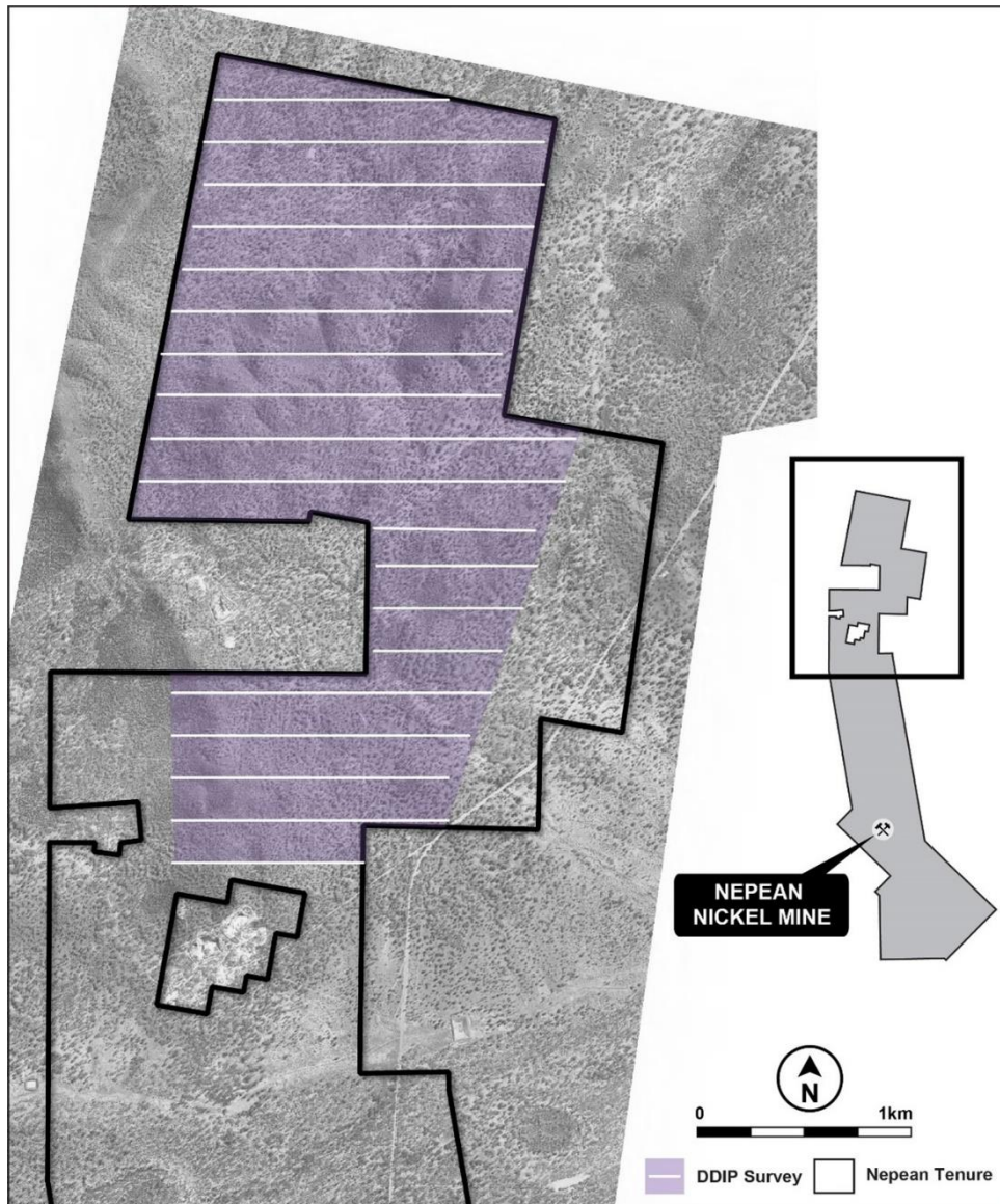
Figure 2 – Map showing location and survey lines of the ground IP survey underway in the north of the Nepean Project. To-date the northern five lines have been surveyed

This announcement has been authorised by the Board of Directors of the Company.